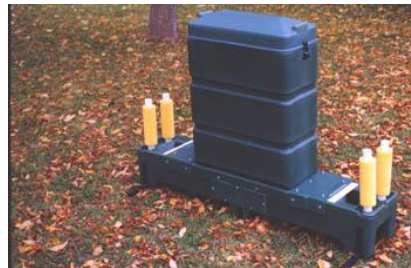
Figure 2: Four Poster Device

The Four Poster (4-Poster) device consists of a central bin containing whole kernel corn used as bait and two application and feeding stations at either end of the device.